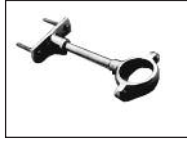
T46-Split ring wall support for flush connection