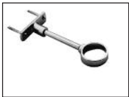
T36-Solid ring wall support for flush connection

P olished chrome plated flush valve, diaphragm type, externally adjustable for water conservation, with 1" capped screwdriver angle stop with back-check, renewable main valve seat, metal "Rubberflex" oscillating handle, "Turn-to-Silence" equipment, for use with off center Diverter Valves, with "Kwikfit" special length threaded union tailpiece, vacuum breaker, wall flange, spud nut and spud flange. Diverter Valve assembly furnished by other.