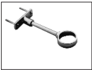
T36—Solid ring wall support for flush connection

P olished chrome plated flush valve, diaphragm type, externally adjustable for water conservation, with 1" capped screwdriver angle stop with back-check, renewable main valve seat, metal "Rubberflex" oscillating handle, "Turn-to-Silence" equipment, with "Kwikfit" threaded union tailpiece, vacuum breaker, wall flange, spud nut and spud flange for 1½" top spud.