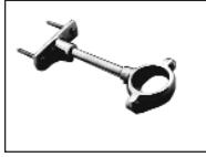
T46—Split ring wall support for flush connection