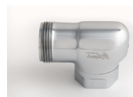
Patented TruStop Control Stop