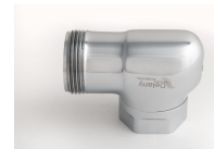
Patented TruStop Control Stop