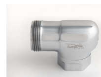
Patented TruStop Control Stop