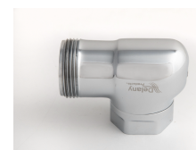
Patented TruStop Control Stop