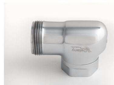
Patented TruStop Control Stop