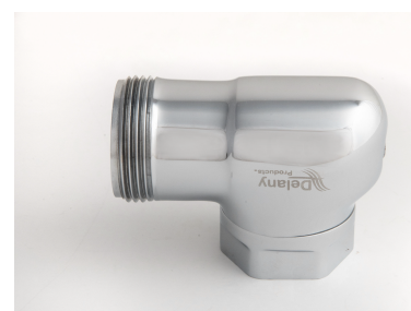
Patented TruStop Control Stop