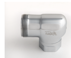
Patented TruStop Control Stop