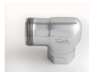
Patented TruStop Control Stop