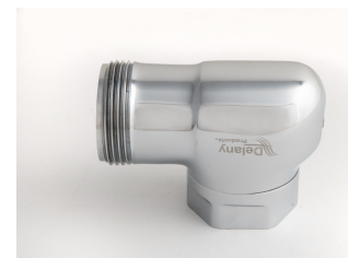
Patented TruStop Control Stop