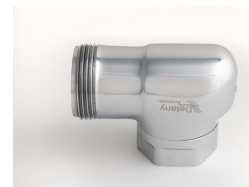
Patented TruStop Control Stop