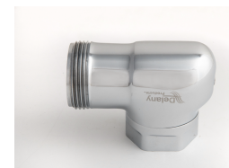
Patented TruStop Control Stop