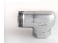
Patented TruStop Control Stop