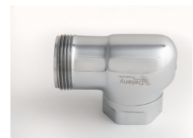
Patented TruStop Control Stop