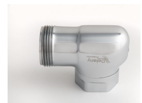
Patented TruStop Control Stop