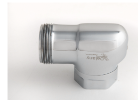
Patented TruStop Control Stop