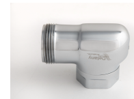
Patented TruStop Control Stop