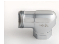
Patented TruStop Control Stop